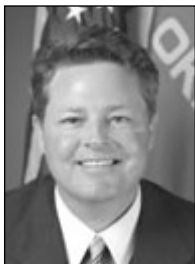
Sen. Jeff Rabon D-Hugo

The resolution passed unanimously, but not before Republicans added a small amendment on the Senate floor, correcting a scrivener's error which had implied Earth was more than 6,000 years old.